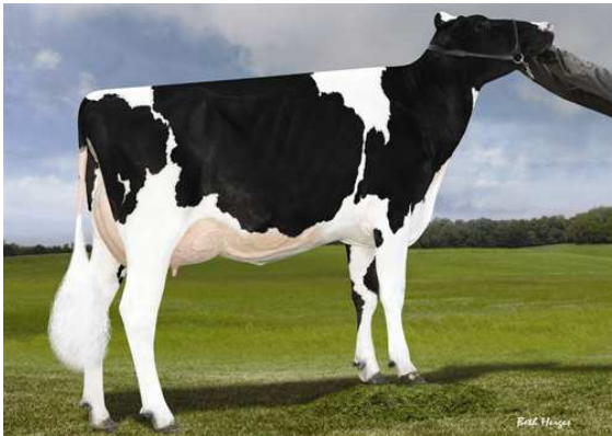
LADYS-MANOR S DAHLIA FIFTH DAM